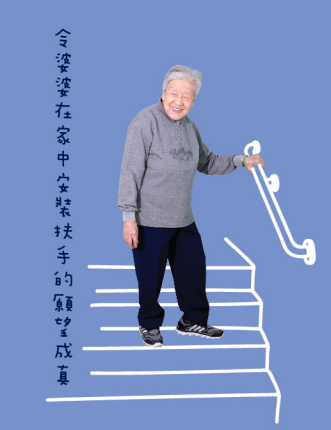
Fulfilling the dream of installing staircase handrails for old lady