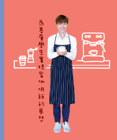
Fulfilling the dream of being a barista for grassroots students